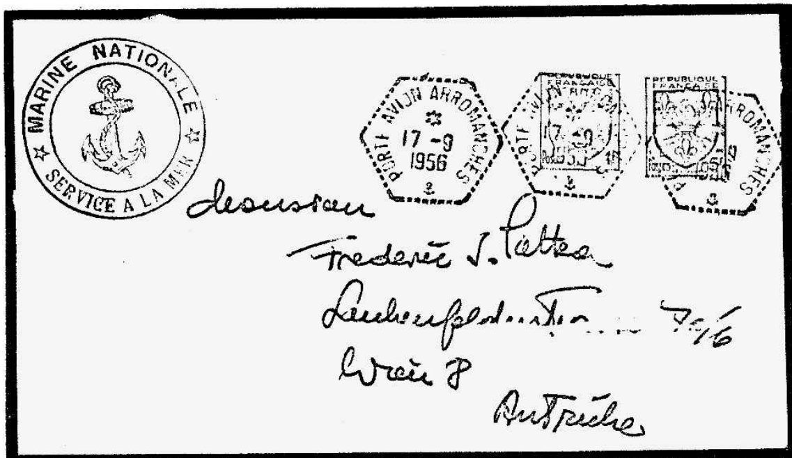
Fig.1 An Example on cover of the first type (A) of Agences Postes Navles (APN) illustrating the hexagonal marking of the aircraft carrier "Arromanches" dated 17 September 1956.

A joint French-English military operation was decided. General Stockwell, Air-Marshal Barnet and Admiral Dunford Slater for the English, and Admiral Barjot and General Beaufre, among others, for the French, took the command. The expedition was prepared in Cyprus where the forces were concentrated beginning in August 1956. The operations lasted only a week, from 31 October until 6 November. When the French and English had the best of it, a very strong American and Russian pressure, followed by a resolution from the United Nations enjoined to stop the fighting. The French Naval Forces consisted of requisitioned merchant ships, auxiliary and "servitude" ships of the French Marine and chiefly of 40 warships. There were among them - four large ships: the "JEAN BART", a ship of the line, the "GEORGES LEYGUES", (admiral ship) cruiser and the "LAFAYETTE" and "ARROMANCHES", aircraft carriers.