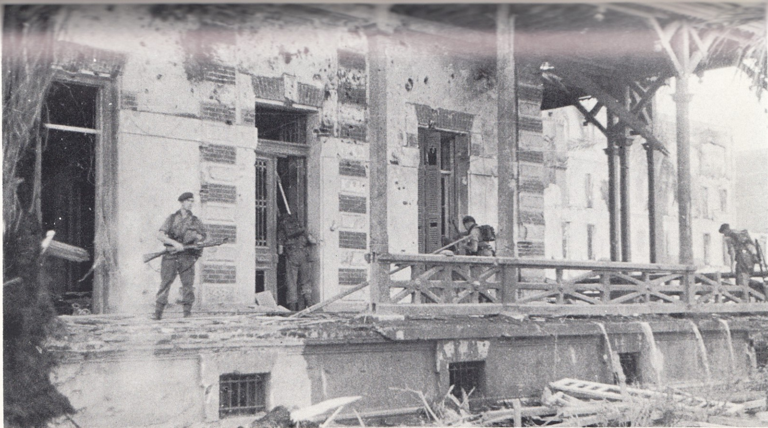
British troops outside wrecked police headquarters in Port Said, November, 1956