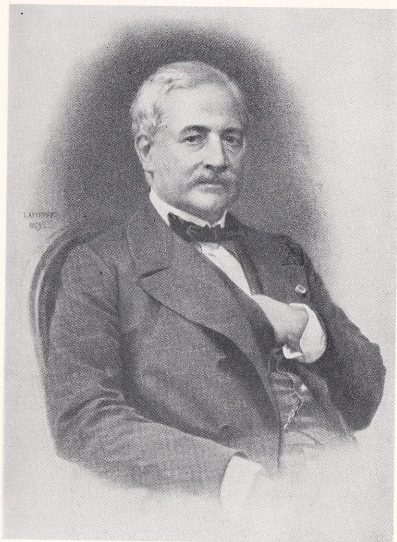
Ferdinand de Lesseps