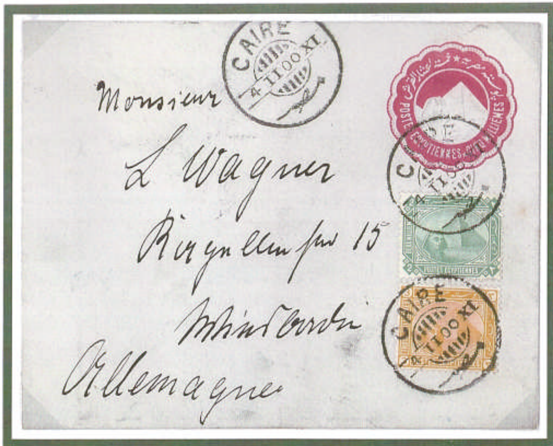
A 1900 five mills stationary cover from CAIRO to GERMANY bearing 3 + 2 mills stamps tied by CAIRO cds dated 4.2.1900 with WEISBADEN cds arrival dated 14.2.1900 on reverse