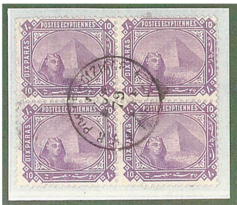
Used block of four dated 1897