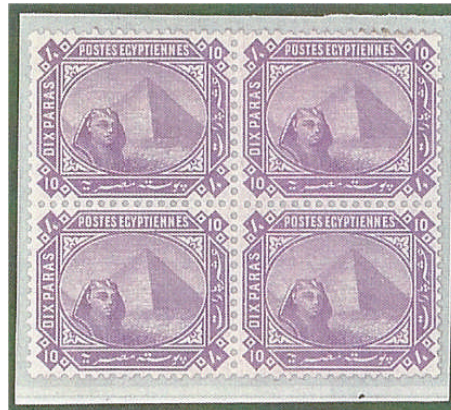
Mint block of four