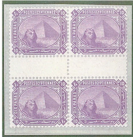
Mint block of four with gutter